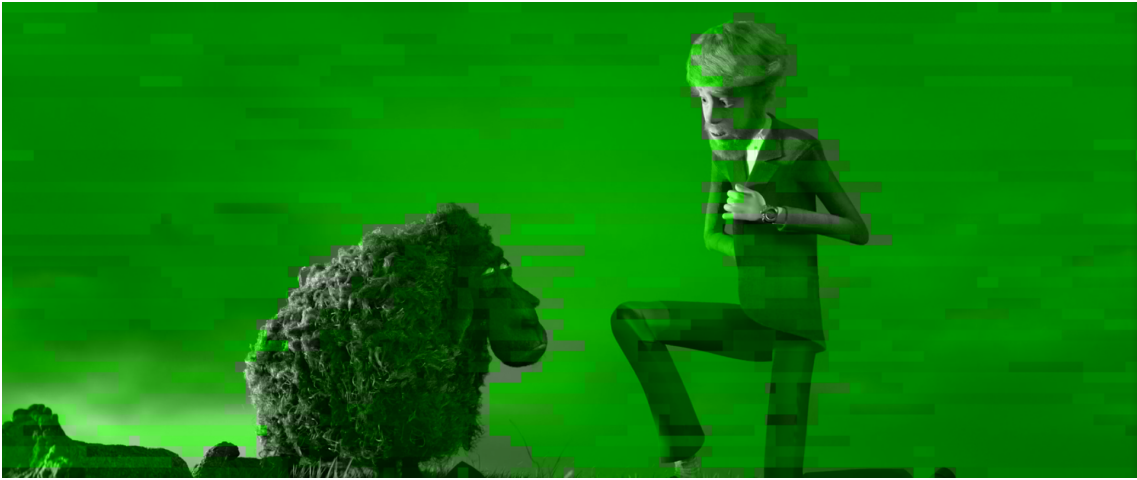
Figure 2: Visualization of the different quantization parameters (QP) within a frame. Lower QP are represented greener. The lower a QP is, the lower the step is, which will result in better reproduction when decoding.

Also, samples close but not equal to zero can be approximated and considered null. For this to happen, they have to be below half of the new step value. Finally, as the rounding happens in the frequency space, quantization error will be spread on the whole block in the spacial domain, instead of keeping a one-off nature.